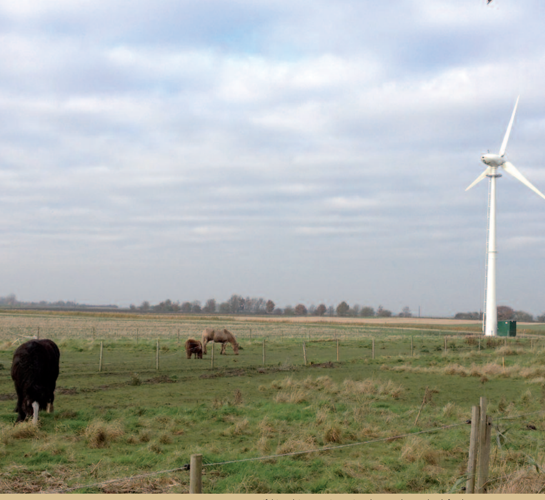
If this advice note is a printed copy, please check for the latest version on www.bhs.org.uk/access-and-bridleways

For more information on The British Horse Society's rights of way work contact: